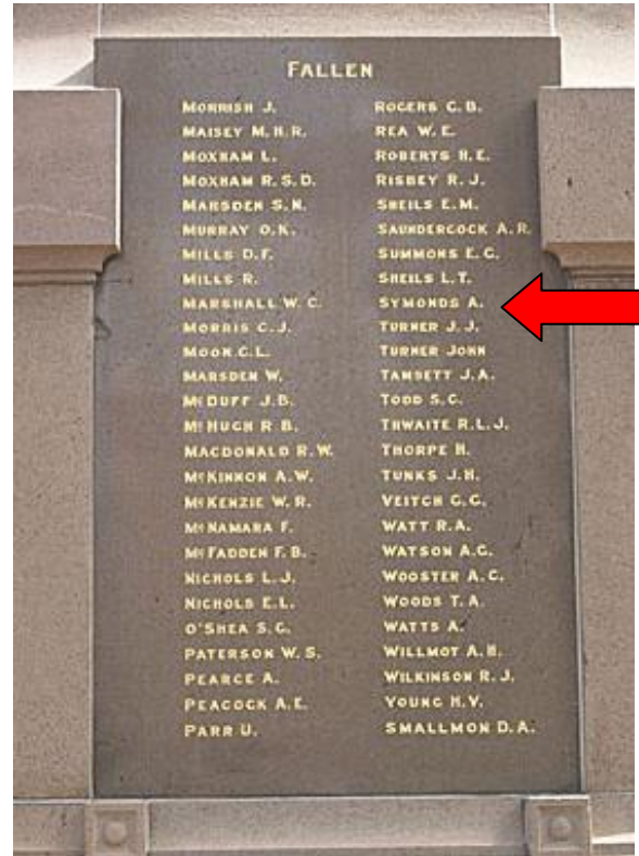
Parramatta War Memorial