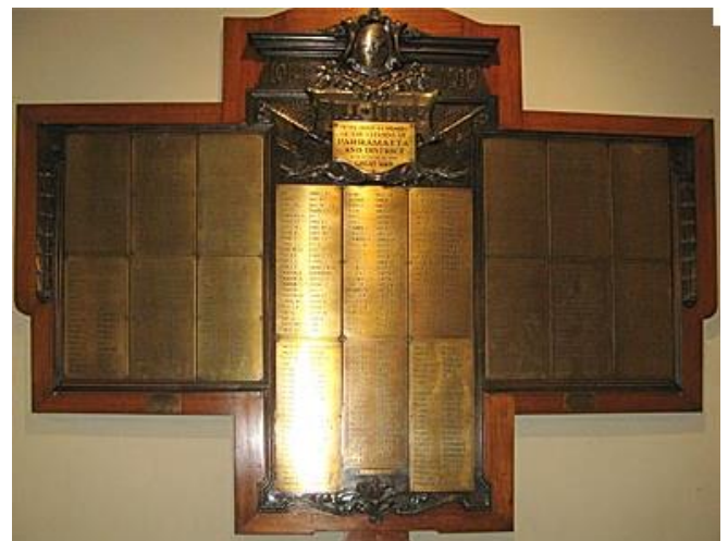
Parramatta & District Great War Roll of Honour